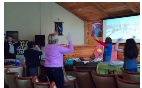
Gospel Light Church