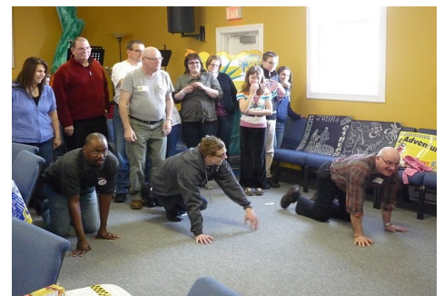
Providence Christian Church